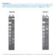
Figure 1. Pulsed-field gel electrophoresis Ascl and Apal profiles of the outbreak of human listeriosis clone, Belgium, 2011

An investigation for possible nosocomial infection was immediately started at the hospital and was inconclusive. Meanwhile, BNRCL continued to receive clinical isolates, with the same microbiological and molecular characteristics