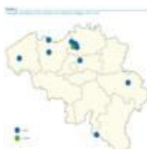
Figure 3. Geographic distribution of the outbreak cases of listeriosis, Belgium, 2011 (n=12)

In search of the source of infection, the BNRCL database was consulted. A hard cheese isolate was identified with similar microbiological characteristics as the outbreak clone. This food isolate was received at the BNRCL a year before, in conjunction with the monitoring programme of the Belgian Federal Agency for the Safety of the Food Chain.